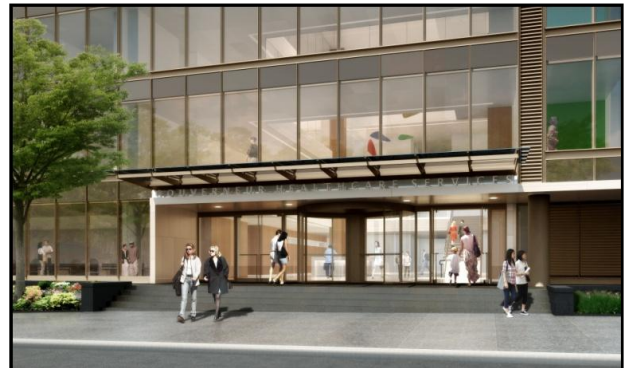
Rendering 2: New Main Entrance

The Gouverneur Healthcare Services building will not be constructed as a LEED project. Design consultants implemented the use of lighting motion sensors as replacement to manual switches for a majority of areas throughout the building. Additionally, as required by code, mechanical infrastructure upgrades will feature energy efficient systems. An alternate to the design, which is to be decided at a later time, is to feature a green roof garden for the use of patients of the hospital on the 6 th floor roof.