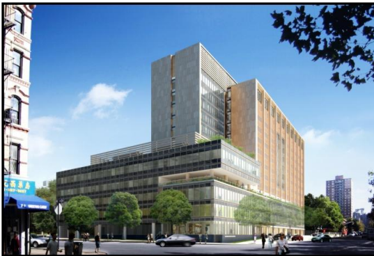
Rendering 1: Exterior View

The building enclosure for Gouverneur Healthcare Services contains a variety of building materials that compose the building façade. The existing buildings façade is composed of an existing brick veneer, concrete columns, and punch-out windows. The existing 2' x 4' windows will be replaced with new 3' x 6' punch windows. The new eight story tower façade is comprised of fabricated wall panel assemblies, structural sealant glazed curtainwall, bronze tinted low-e insulating glass, and a flat resin panel screen up on the penthouse level. The new five story building façade is comprised of bronze tinted low-e insulated glass, glazed aluminum curtainwall, fabricated wall panel assemblies, and flat resin panel screen on the 6 th floor penthouse. The described façade can be seen in Rendering 1 and Rendering 2, both courtesy of RMJM Architects. The new main entrance will feature a bronze tinted glazed revolving door and glazed aluminum storefront doors. The roofing system of the building consists of a hot fluid-applied, rubberized asphalt waterproofing membrane, elastomeric flashing sheet, fiberglass reinforced rubberized asphalt sheet, insulation drainage panels, filter fabric, and stone ballast.